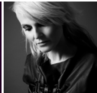
Faithless DJ Set