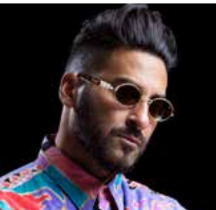
Armand van Helden

We always bring our friends to the party and we can bring them to yours. Recent guests at our Cream events have included: