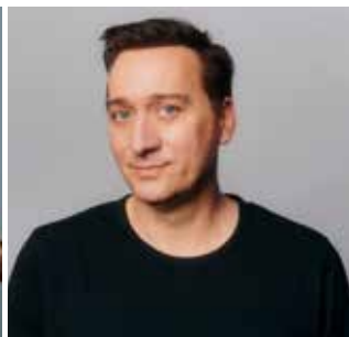
Paul Van Dyk